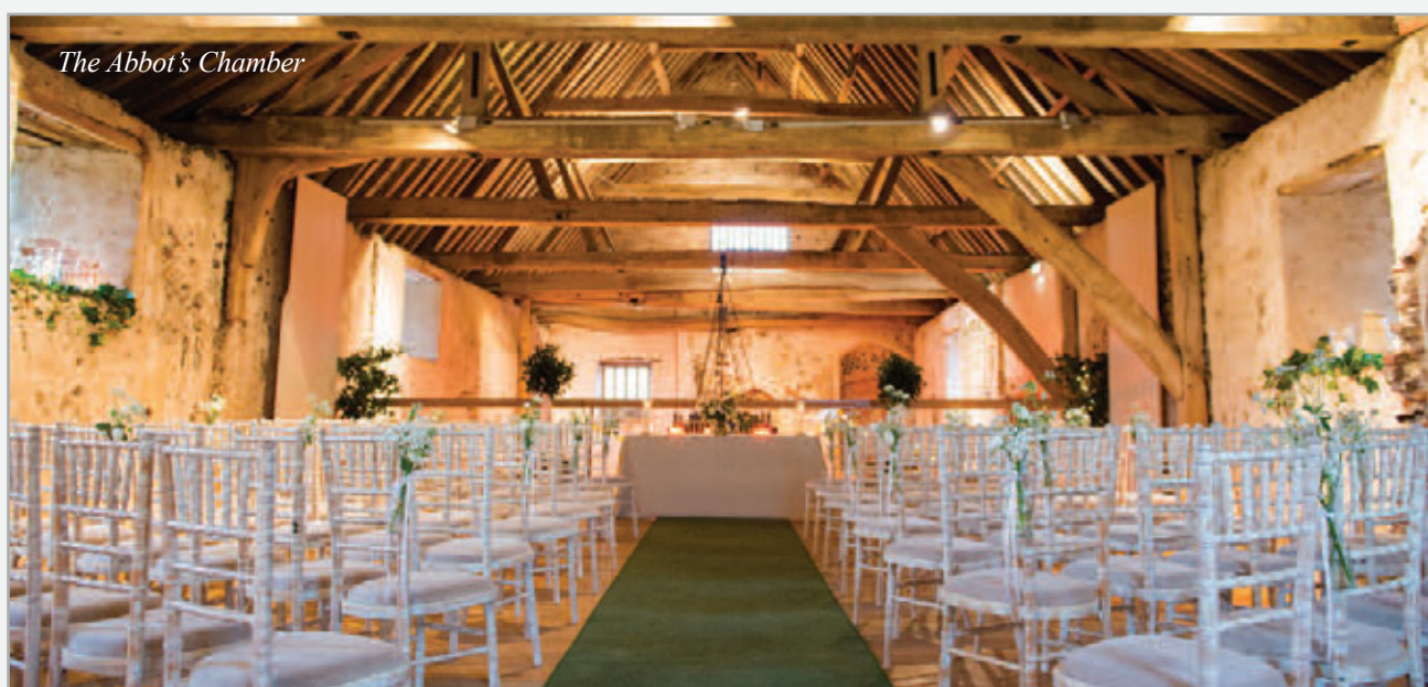
The Abbot's Chamber

This is followed by a scrumptious Wedding breakfast under the vaulted ceiling in the main hall. Then into the gothic and atmospheric cellarium, where you and your guests can dance the night away. A luxurious bridal suite is also available for the perfect end to the perfect day. There are also larger barns for other guests.